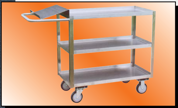
Model YO Shown