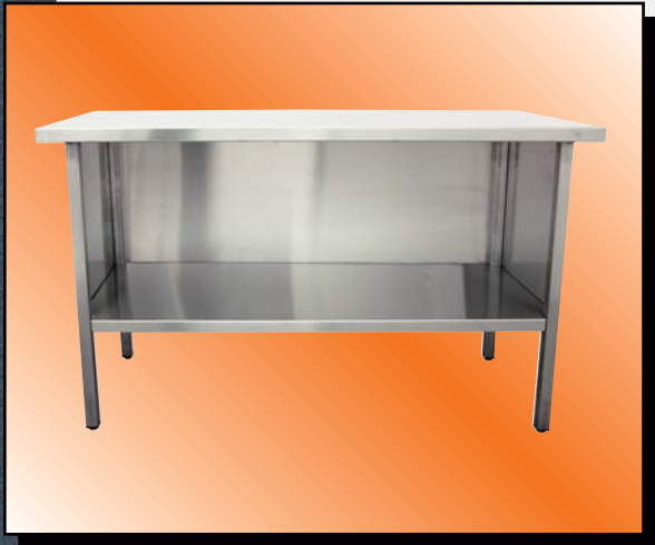
Model VN Shown