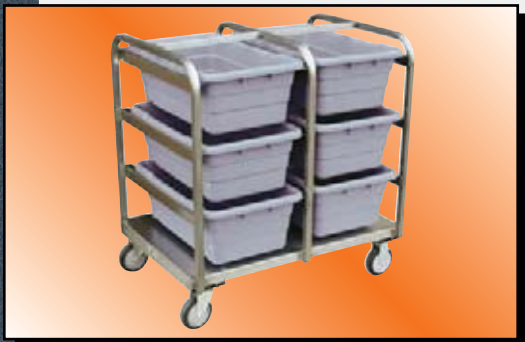
Model YA Shown