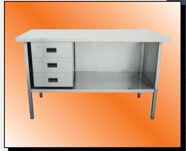
Model VP Shown