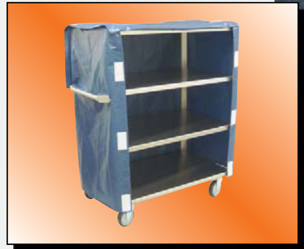
Model ZL Shown