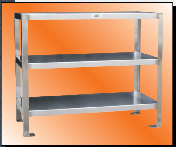
Model YG Shown