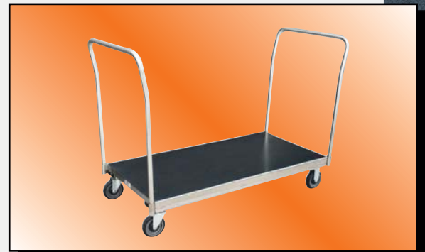
Model YP Shown