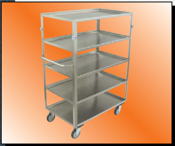
Model ZY Shown