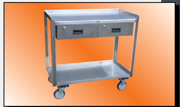
Model YR Shown