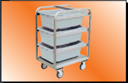
Model YH Shown