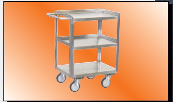
Model XV Shown