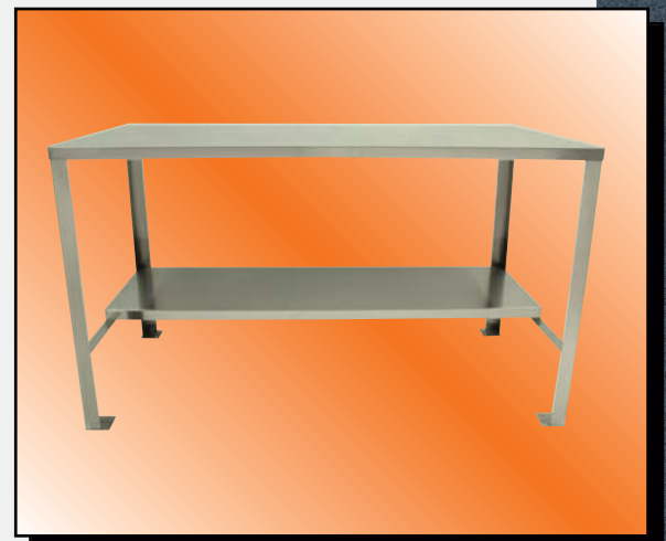
Model YE Shown