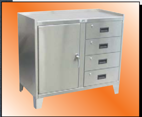
Model ZV Shown