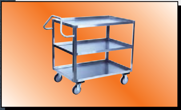
Model XT Shown