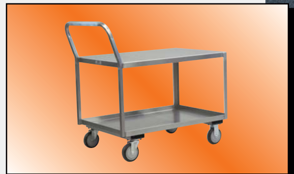
Model XL Shown