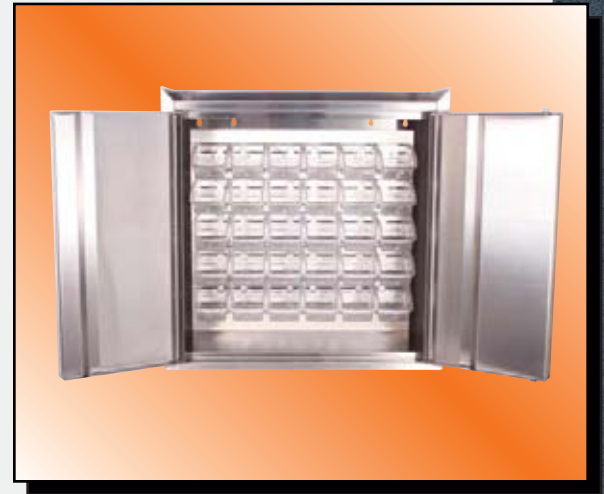
Model KP Shown