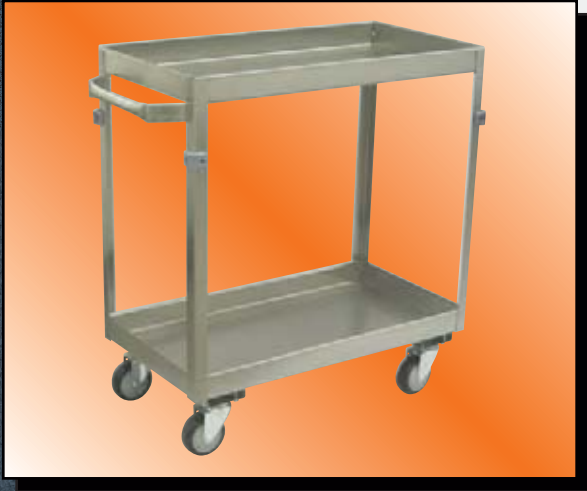
Model ZM Shown

BOXED TO SHIP FED EX GROUND Note: 22" x 48" Ship Freight