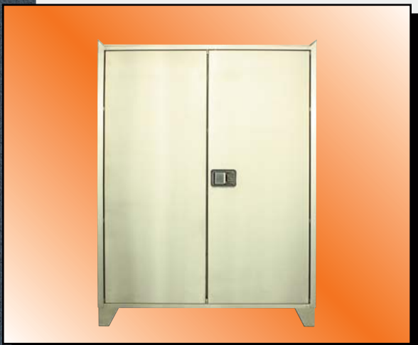
Model KV Shown