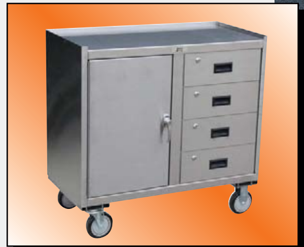
Model YY Shown