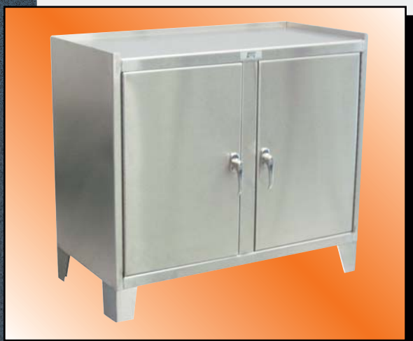
Model ZP Shown