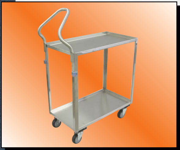
Model ZG Shown