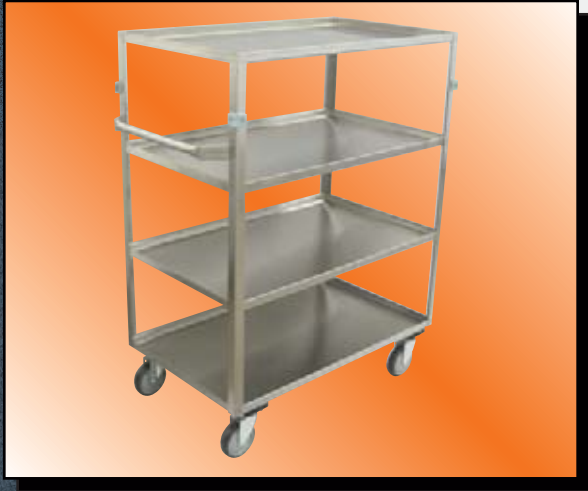
Model ZX Shown