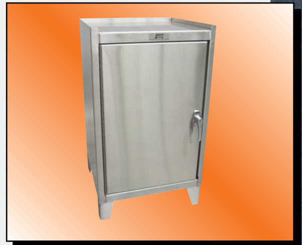
Model VY Shown