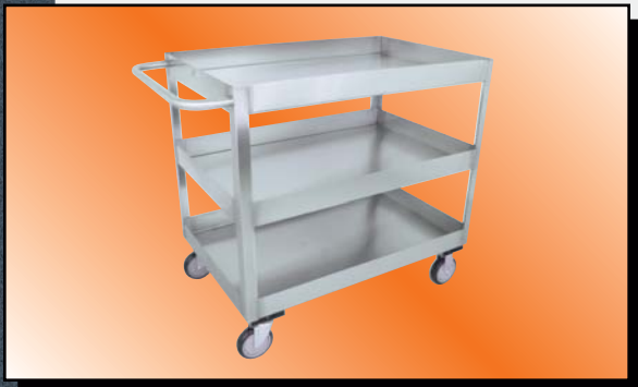
Model YU Shown