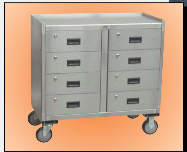
Model ZO Shown