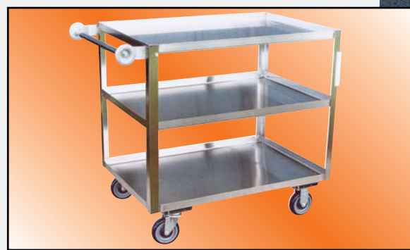
Model XJ Shown