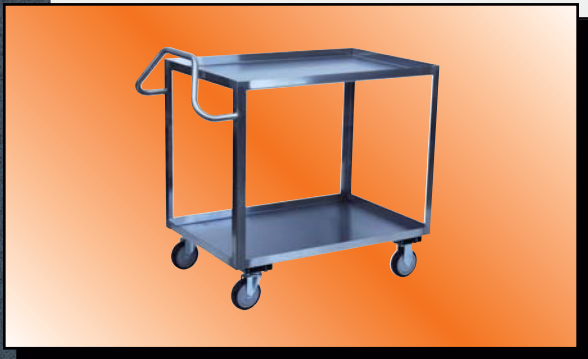
Model XS Shown