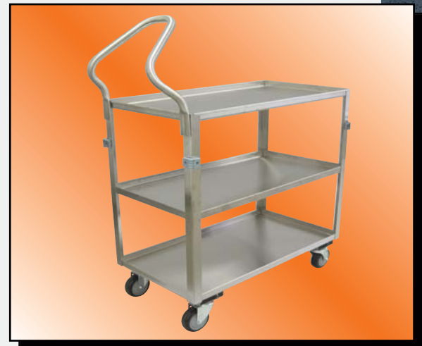
Model ZK Shown