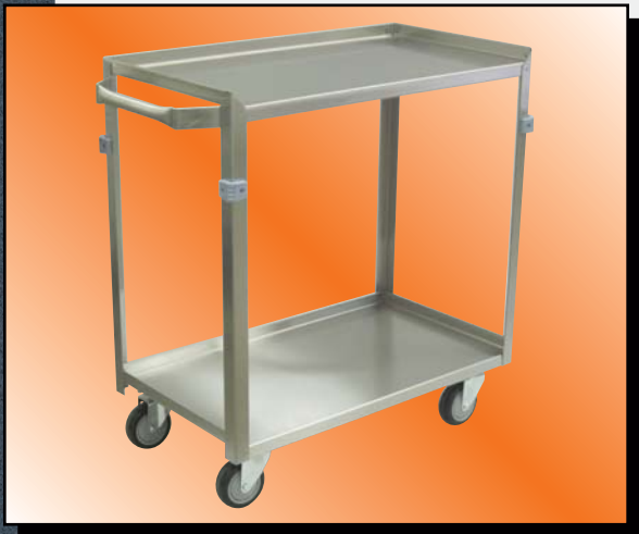
Model ZF Shown