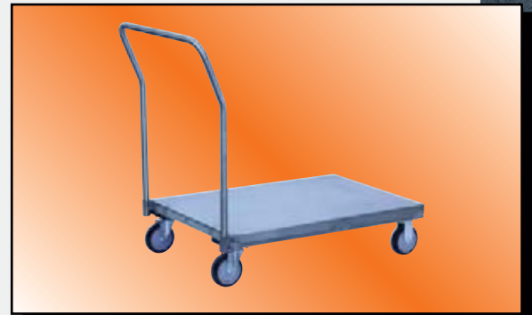
Model XP Shown