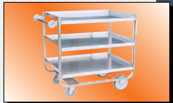
Model XG Shown

1,200 LB CAP.* (*800 lb with thermorubber casters)