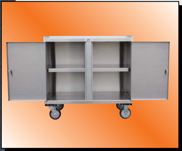
Model YZ Shown