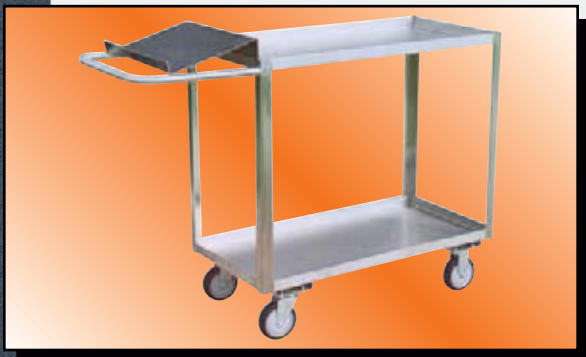
Model XO Shown