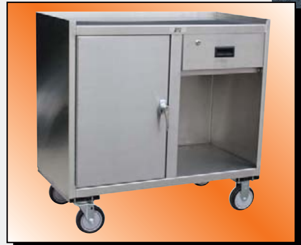
Model YX Shown