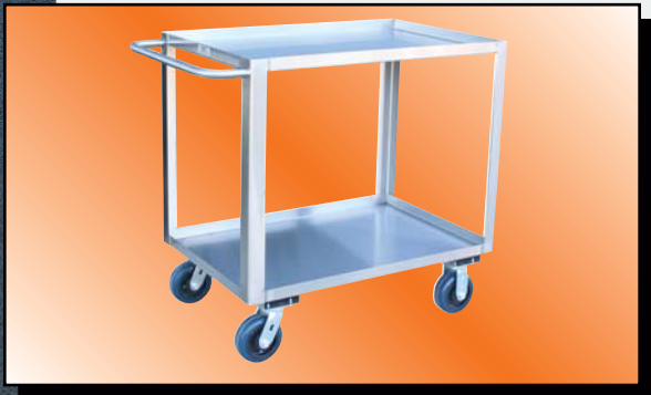
Model YJ Shown