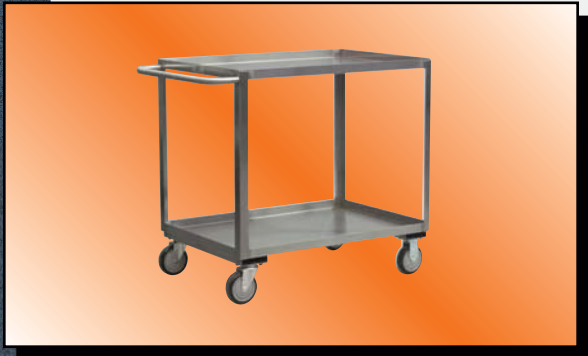
Model XB Shown