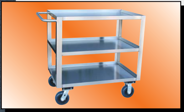
Model YN Shown