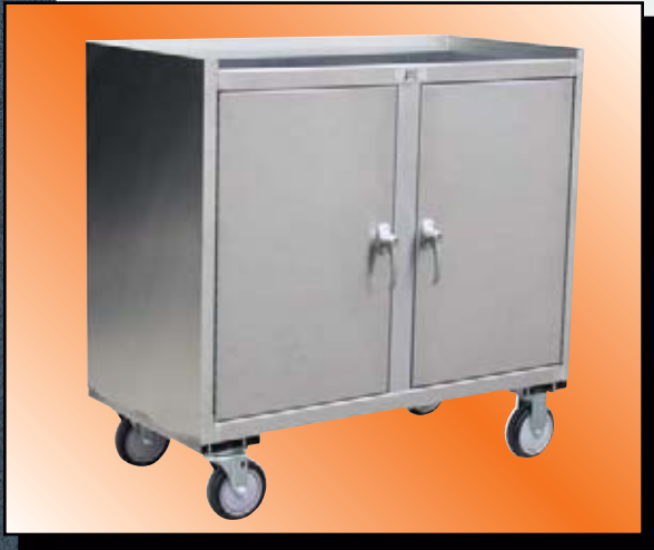
Model YW Shown