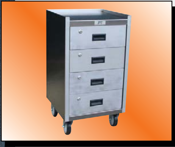
Model YF Shown