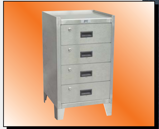
Model VW Shown