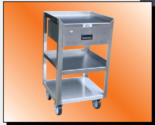
Model XR Shown