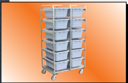
Model YQ Shown