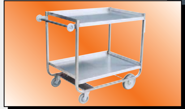
Model XF Shown

1,200 LB CAP.* (*800 lb with thermorubber casters)