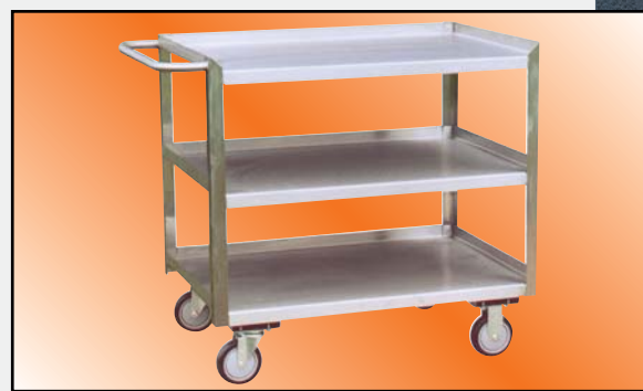
Model XY Shown