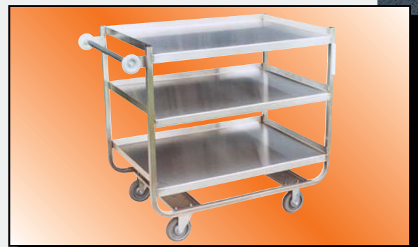
Model XN Shown

1,200 LB CAP.* (*800 lb with thermorubber casters)