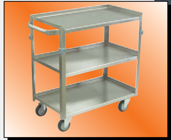
Model ZJ Shown