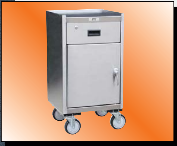
Model YS Shown