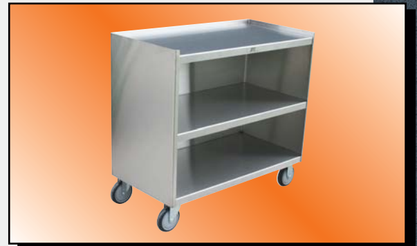
Model YC Shown