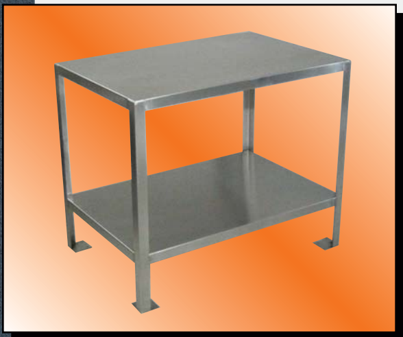
Model XW Shown