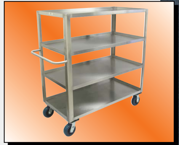
Model XD Shown