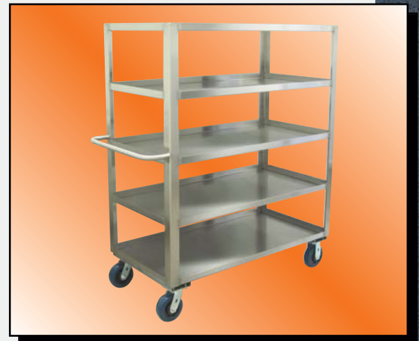
Model XE Shown