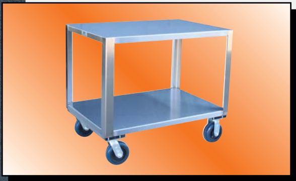
Model YM Shown