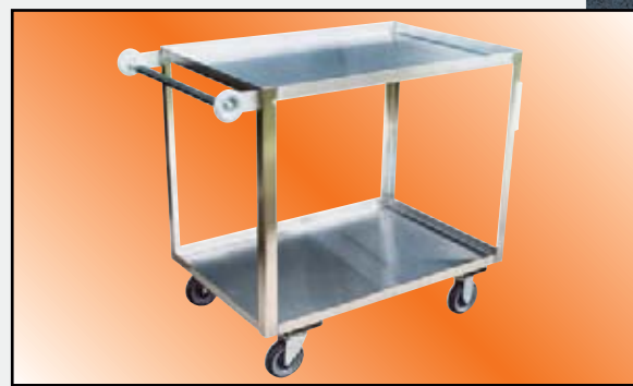
Model XH Shown