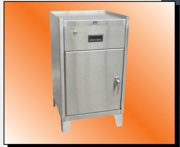
Model VX Shown