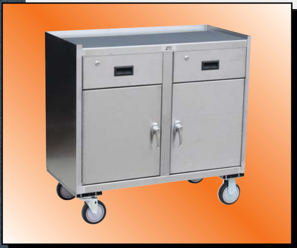
Model YV Shown