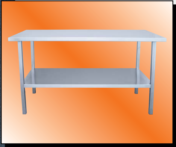
Model UK Shown