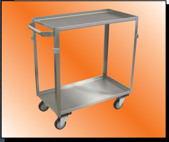
Model ZE Shown