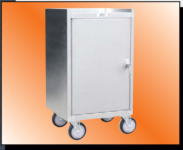
Model YT Shown