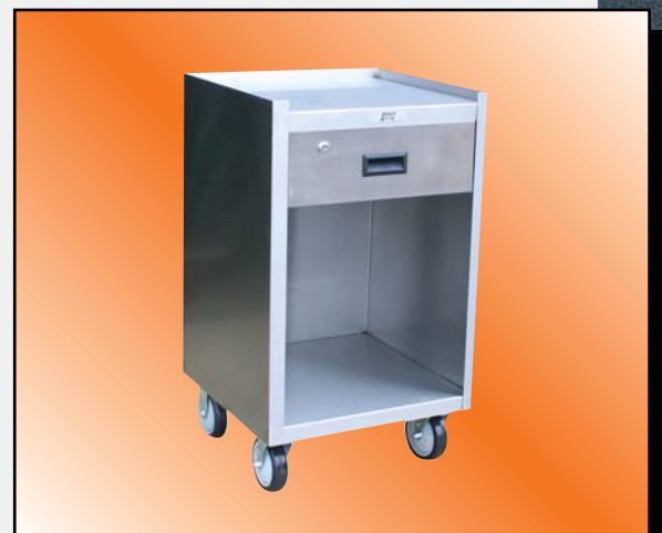
Model YD Shown