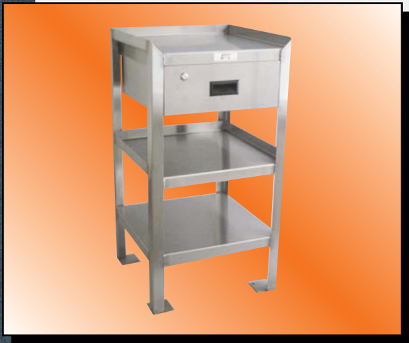
Model XU Shown