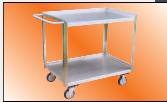
Model XK Shown