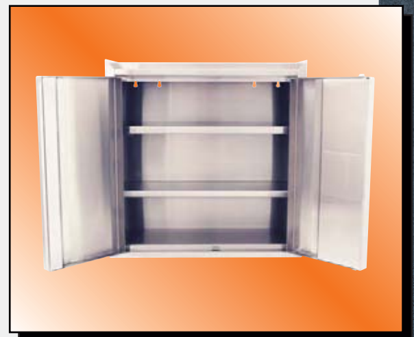
Model KS Shown