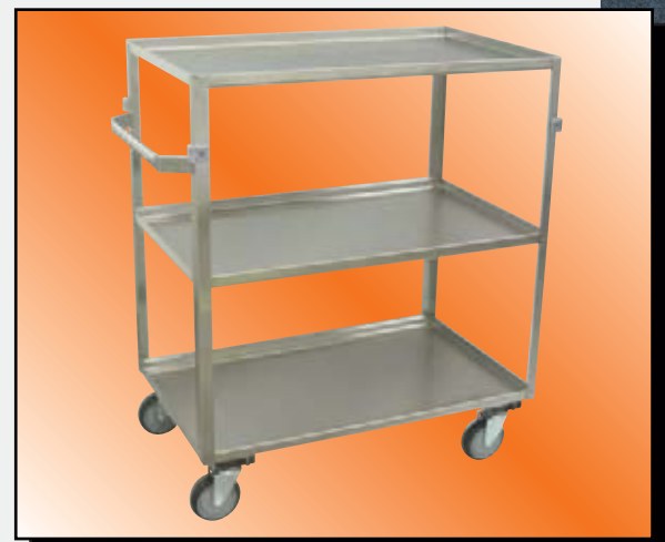
Model ZW Shown