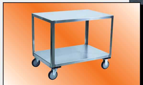
Model YB Shown