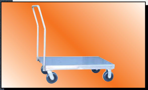
Model YL Shown