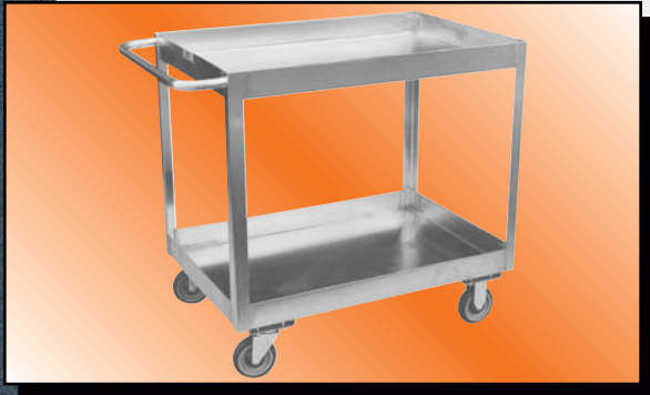
Model XZ Shown