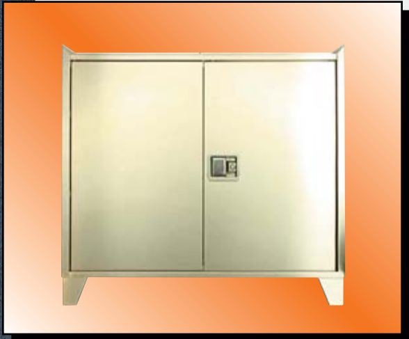
Model KU Shown