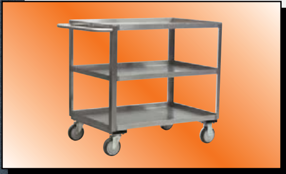
Model XA Shown