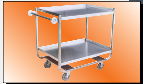
Model XM Shown

1,200 LB CAP.* (*800 lb with thermorubber casters)