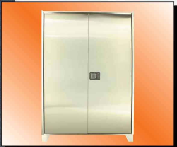
Model KW Shown