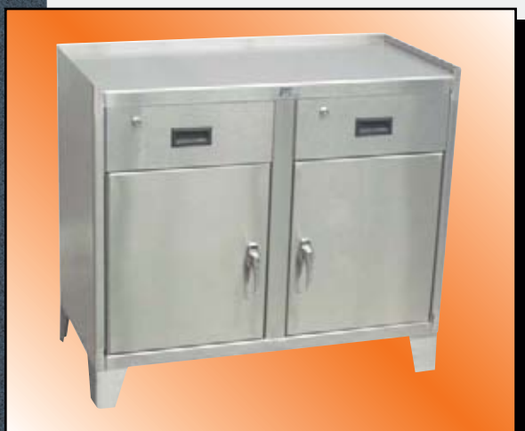
Model ZU Shown