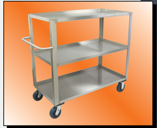
Model XC Shown