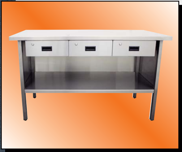
Model VO Shown