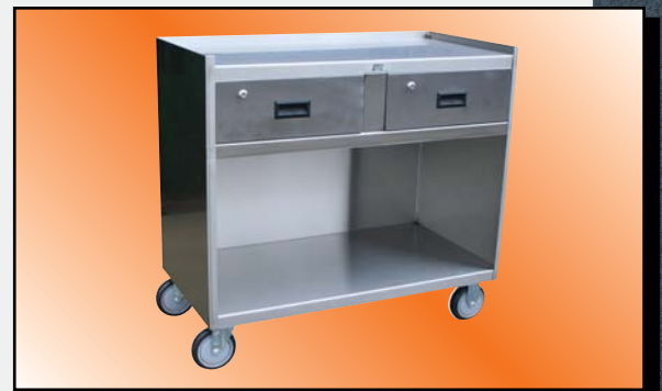
Model YK Shown