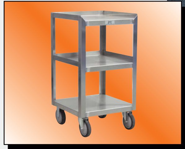
Model XX Shown